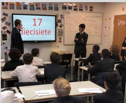
Year 11 linguists putting our new Year 7 cohort through their paces teaching them Spanish. What exceptional young men and bilingual future leaders

October started with our Open Evening and there was also so much more. To mention just a few, we have had some excellent highlights this month. Firstly, teaching and learning is what we do (and our core purpose), and what we are most proud of. I thought it would be great to share some of our wonderful students in action below covering a whole range of activity from linguistics masterclasses; culinary excellence; maths mastery and some outstanding designing as part of the DT/Art offer.