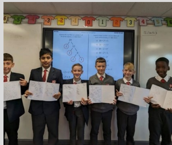
Y7A Studying Prime Factors in Maths!

I am utterly privileged to lead a school where staff are forever looking for what opportunities, experiences or activities they can plan and deliver to enrich the lives of all students.