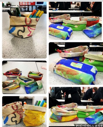
Year 7 pencil pouches for this terms DT rotation. Well done gents on a creative half term!