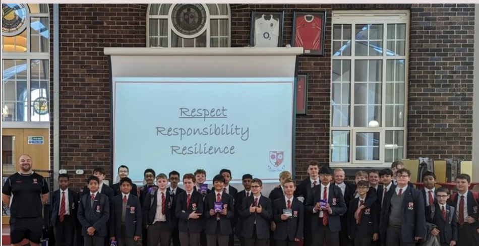
Some of our Year 8 Prize Winners are above! Showing respect for themselves, others and their learning journey at Audenshaw School.

In other news this month, we celebrated the final week of the half term all our amazing students for their achievements and successes. Respect has been the value rewarded as part of student learning and also many other subject prizes not to mention attendance.