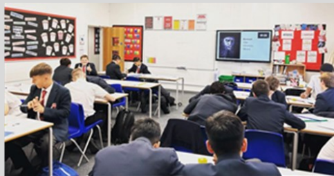
Y10 Descriptive Writing Skills

Students have conducted themselves very well around site considering we have our largest student intake in our History. It is vital that we move around site to the left and seeing so many of our older students help the Y7s navigate around the school site has been great to see also, our values in action. This year we have also opened up our Main Hall at break and lunch in order to ensure all students have somewhere inside school to eat and drink should they wish to, vital also as we move into the winter months. As part of our new push on keeping our site clean please do support our message that students do not take purchased items outside of these areas, there is adequate space for students to socialise and eat indoors.