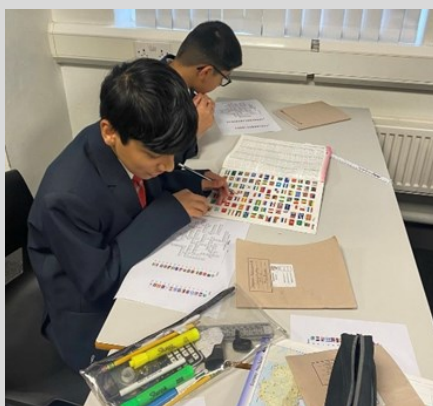
7N are getting competitive this half term in Geography with flag crosswords and a world quiz.

This month we had an exceptional open evening event and the feedback was just as impressive. Thank you to you all, our families who are the true advocates of what we do. We had record numbers of families visit our school and the future of our school is as ever as strong as it can be. Since the Open Evening we have also welcomed many families to come and see us 'in action' and showing them round site fills us with pride, your sons' are part of purposeful, engaging and vibrant learning environments, daily.