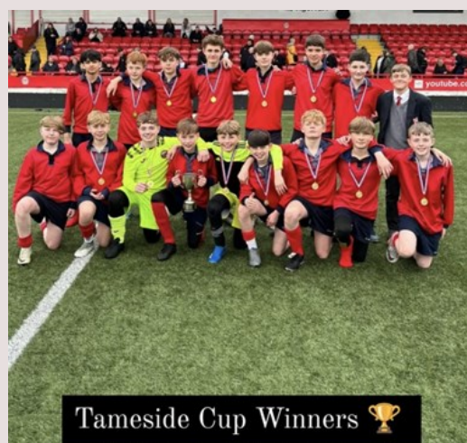
Tameside Cup Winners 🏆