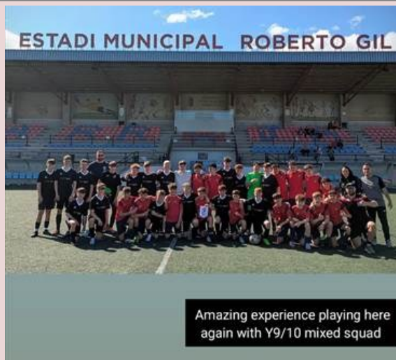
Amazing experience playing here again with Y9/10 mixed squad