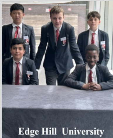
Edge Hill University

Year 9 teams from Audenshaw School participated in the annual Edge Hill University Mathematics Challenge. Students worked together in teams of 5 to tackle problems and find solutions. There were over 150 entries from teams across the country. One of our teams made it to the final where 11 teams presented their solutions to problems to a panel of judges from the University. Well done team Calculate Every Circle (CEC).